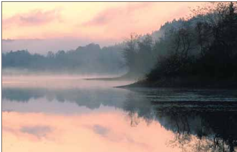
Jacky Tiplady. Terry's Creek . Photograph.

Patients with cancer are at high risk for venous thromboembolism so surveillance and monitoring for this complication are keys to good oncologic practice.